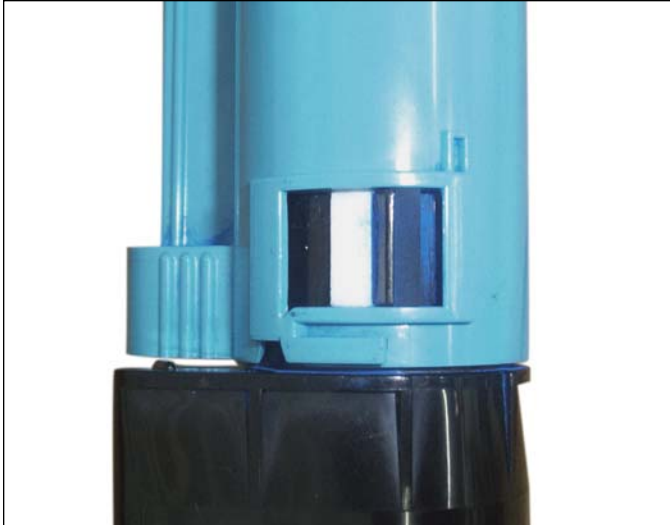
3. This is the starting point.