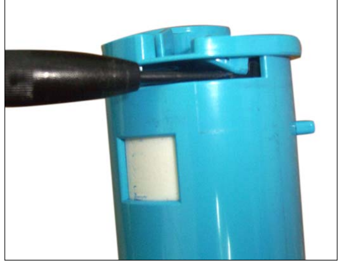
2. Use a small flat-head screwdriver to lift the tap over the stopper and allow you to turn the blue end piece counter-clockwise (color of end piece varies on color of cartridge).