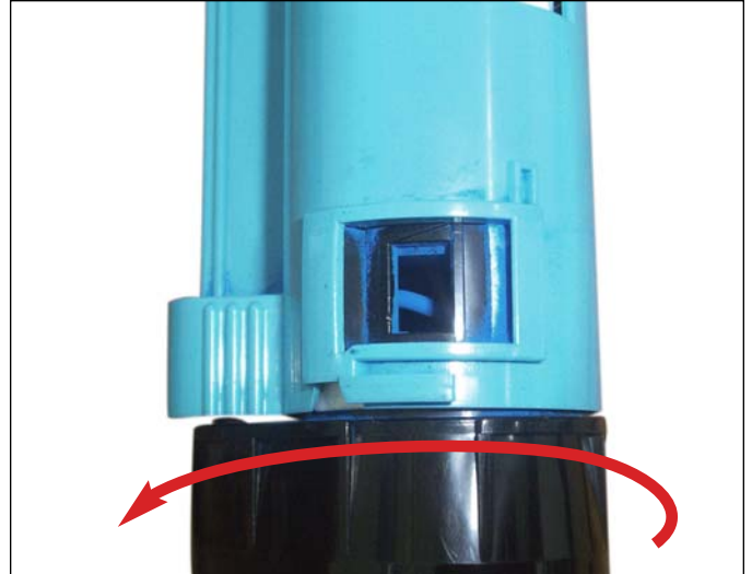
4. Turn the cap until the tab comes to a complete stop and has entered under the blue cap.