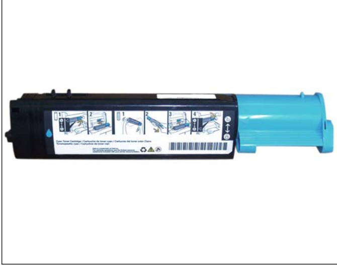
1. Disassembling the toner cartridge, starting from the lock position.